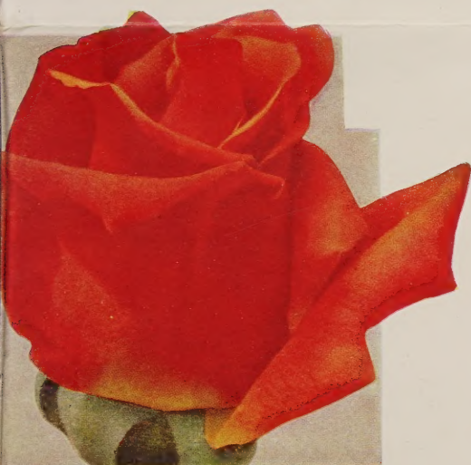
CL. MRS. SAM McGREDY (Pat. 394)